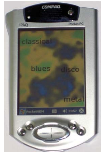
Figure 5: MobileSOMPlayer on a PDA